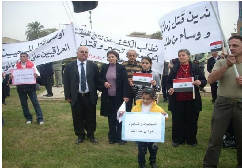
Hammurabi is leading the demonstration Fardos square

●Hammurabi Human Rights Organization warned of the dangers threatening Iraq, in attempts to erase Christian national presence, The organization highlight this ancient historical presence and the attempts of displacement and destabilization practiced against Christians, and if we return to the temporal background of this unjust terrorist policy that was committed against Christians in the genocide during the First World War, and after the establishment of the Iraqi state it was remarkable the Simele massacres in 1933, led to bombing, displacement and removal of Christian villages, towns and cities during the Anfal genocide in 1988 and other military operations and the collusion between Saddam Hussein's regime and successive Turkish regimes to inflict serious damage on Christian areas in the areas of Dohuk and Nineveh. after the change in 2003, and that Hammurabi organization after its establishment in 2005, confronted the dangers threatening Iraqi Christians besides series of stances about what Christians subjected to in the capital Baghdad, especially the neighborhoods of Dora, Karrada, New Baghdad, Nairiyah, Palestine Street, Al-Mashtal, and others. It was clear stance by issuing statements, holding conferences and workshops as part of the campaigns to defend religious freedom and exposing abuses on Christian rights,