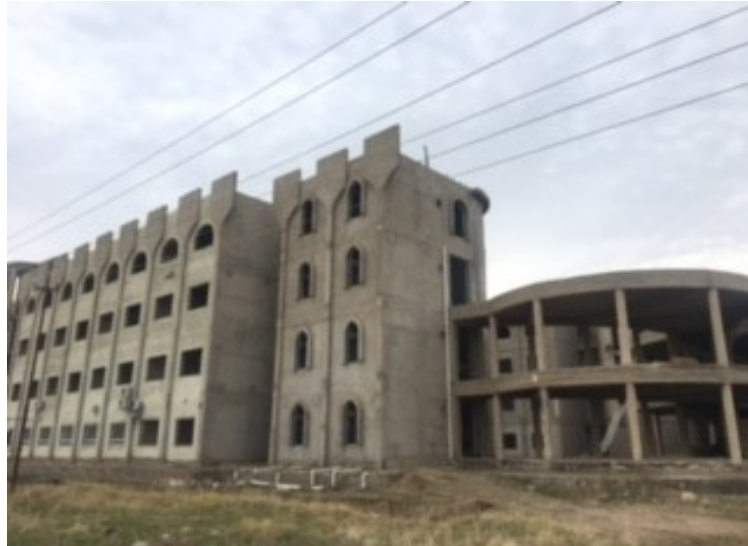
before the university building completion destroyed by ISIS

that the organization is proud of, after the students of Nineveh Plain including Christians, Eizidies, Shiite , Shabaks who were attending the University of Mosul, were exposed to killings and harassment on their way from their areas to the city of Mosul or during return home.