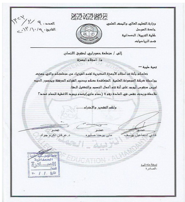
Document on receiving Chemistry lab.