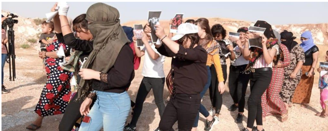
The families of the Yazidi victims search for the remains of their relatives in the mass graves