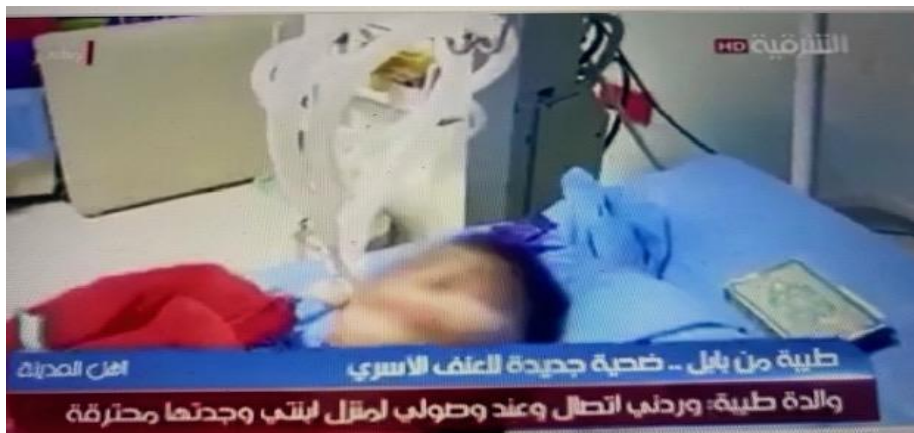
That their daughter's husband had deliberately burned her and did not try to save her