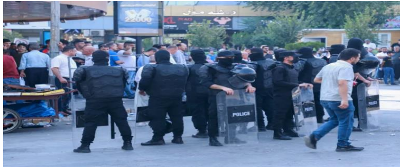
In the photo here, the security forces confront the demonstration in Sulaymaniyah and used tear gas and rubber bullets

demanding services and an adjustment to the economic situation." She added, "The authorities in the region suppressed the demonstrations".