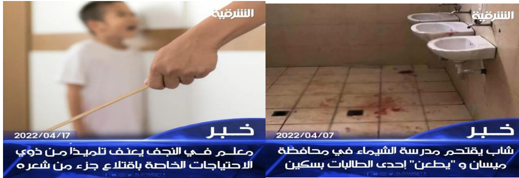
Pictures that testify to the horrific violence practiced, from which even people with special needs are not spared, and girls having their blood spilled with knives in the school bathrooms.

UNICEF called on the Iraqi government to establish monitoring and follow-up mechanisms for perpetrators of crimes of violence and murder against children and to bring them to trial. Unfortunately, as the Hammurabi Human Rights Organization monitored, the violence of Iraqi children has reached an alarming and bloody level in school as well by teachers and students among themselves, and increasingly in secondary schools. Therefore, the organization demands the respected Minister of Education strictly direct the educational staff to prevent beating and violence in all its forms against children and to adopt correct educational methods that enhance the child's energies by teaching him to think, understand and initiate creative initiatives instead of dwarfing him in violent behavior and bequeathing it to him.