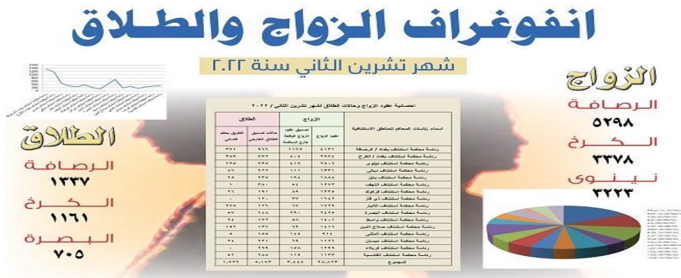
Infographic of marriage and divorce for the Supreme Judiciary

The Hammurabi Human Rights Organization has monitored a significant increase in the phenomenon of divorce and family breakup, According to a statement issued by the Iraqi Supreme Judicial Council, and the schedule of November on the website of the Supreme Judiciary states that there were 1337 cases of divorce in Rusafa district only that took place in November, 2022, and (1161) cases in Karkh district and (705) cases in Basra.