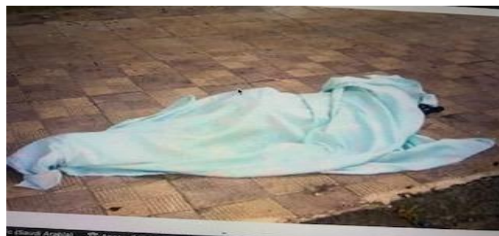
IQ Baghdad, the girl killed by her brother

10- A girl was killed by her brother, south of Baghdad, in the Dora region, stabbed and shot on November 20, 2022, and fled to an unknown destination. The security source stated that "the girl lives in Amarah and works as a dancer in a nightclub and lives in Dora with her friends," and he added, "According to the claim of her friends, she was killed by her brother, as she ran away from her family.